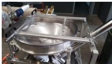
Option: Clear Polycarbon Lid